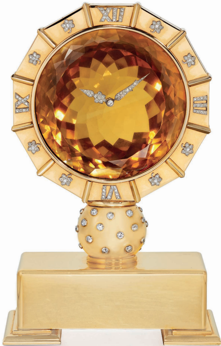
Property from an Important Private Collection RARE CITRINE AND DIAMOND MYSTERY CLOCK, CARTIER, CIRCA 1940 CHF 200.000-300.000